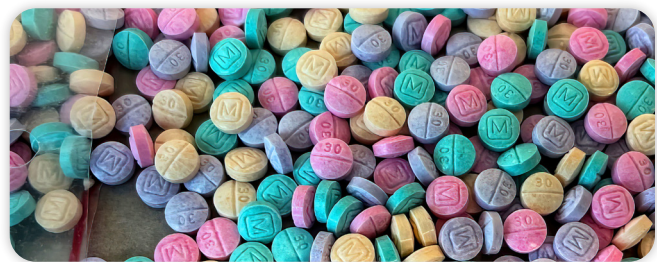
*FAKE rainbow oxycodone M30 tablets containing fentanyl